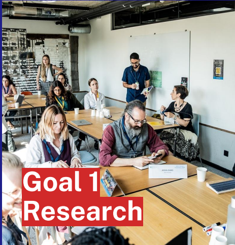
Goal 1 Research