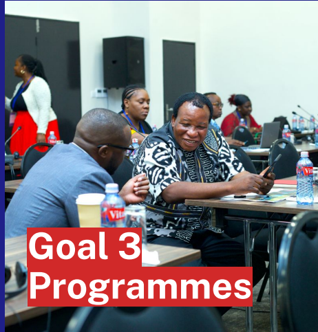
Goal 3 Programmes