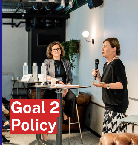
Goal 2 Policy