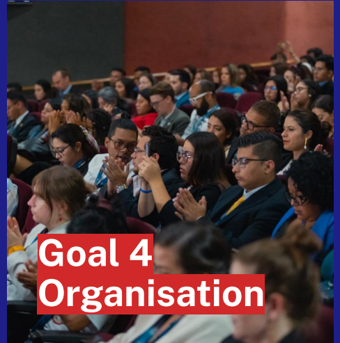
Goal 4 Organisation