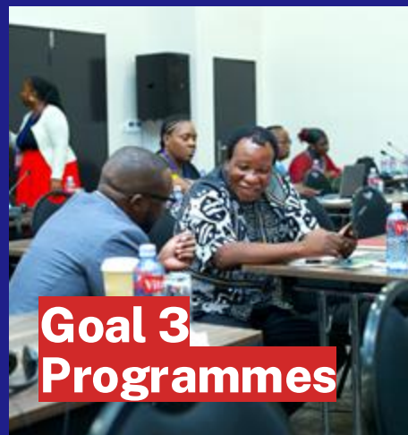
Goal 3 Programmes