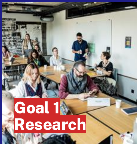
Goal 1 Research