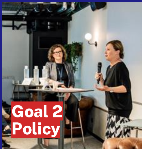
Goal 2 Policy