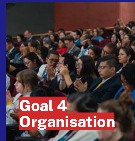
Goal 4 Organisation